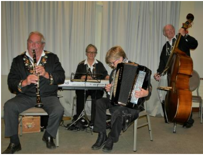
The Swiss folk Band