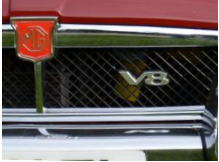
Reproduction grille mesh from the 1990s - you can see the bold feature on the mesh panel is reversed.