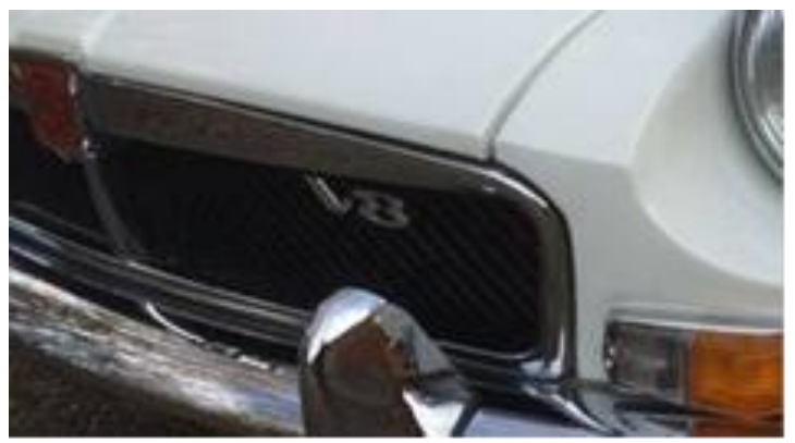
On this chrome bumper grille the V8 badge is too high and too far to the nearside of the grille. Note also the restorer has got the sidelight-indicator light unit the wrong way round too! The side light should be on the outside marking the edge of the front of the car and the indicator inside.