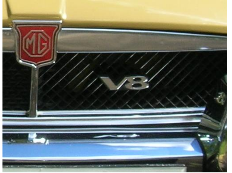
An original grille mesh fitted to a chrome bumper MGBGTV8.