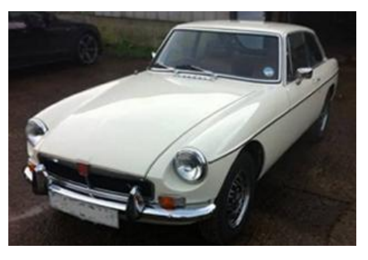
Make sure you have the right grille mesh!