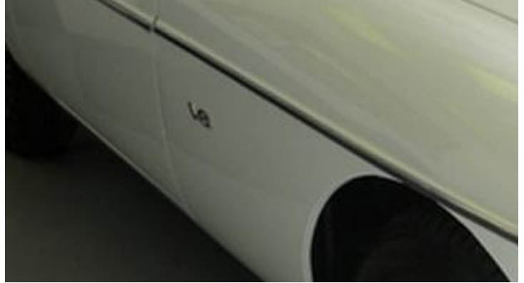
The restorer also located a V8 badge on the offside wing , again in the low position and without a "BL" badge.