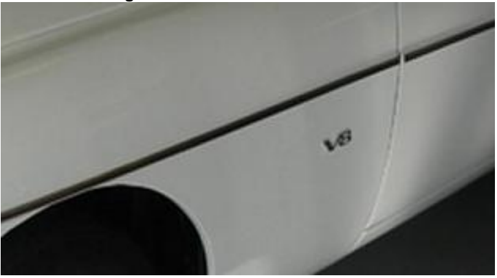
V8 badge on the nearside wing but far too low and the square BL badge is missing too. In some cases back in the late 1970s owners of MGs were so disgusted with how BL had closed the MG Factory in Abingdon that they removed the BL badge as a protest!